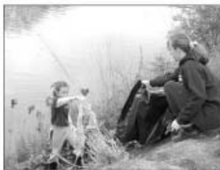
Volunteers picked up an estimated 39 tons of trash at the 2004 Chicago River Day.

Friends' on-the-ground projects physically improve the health of the river for the plants, animals and humans within its watershed. Reflecting the steadily improving river, in 2004 Friends officially changed the name of Chicago River Rescue Day to Chicago River Day. A record-breaking 3,100 volunteers working through the morning from the Cal-Sag Channel to the northern suburbs made the event a tremendous success.