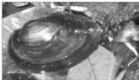
Because of clean water and healthy habitat, native mussels flourish in the North Branch of the Chicago River.

Within Chicago, Friends' Planning Committee continues to work with river-edge developers to be sure new developments incorporate river-friendly design. For example, Friends began working with the Rezmar Corporation in 2001 as they planned to develop an-acre site on the South Branch of the Chicago River between Roosevelt Road and 18 th Street. The partnership has proven successful. In early 2004 the Chicago Plan Commission approved a plan for the South Branch Meander Site which includes public open space, rooftop gardens, trails and habitat protection. Additionally, the approved South Branch Meander Site plan does not add stormwater meaning there will be less pollution from sewer overflows.