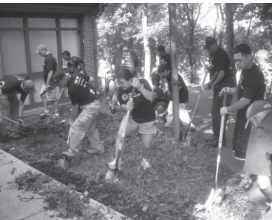
Volunteers from HSBC create a rain garden to capture downspout runoff.

Success in restoring the watershed and improving the health of the river will depend on how well the people that live in the Chicago River watershed interact with the river and manage their activities that affect the watershed. Awareness of your watershed and the impacts of stormwater runoff is the first step in changing behavioral patterns to enact positive change for the future of the Chicago River.