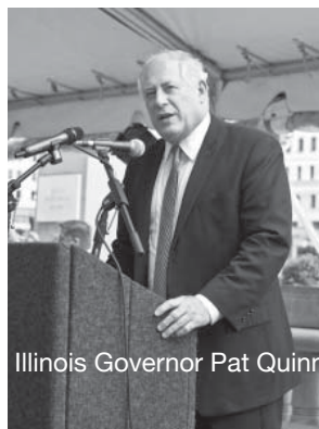
Illinois Governor Pat Quinn speaks at the 2011 Big Fish Ball.