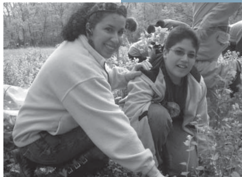
River Day volunteers prepare the floodplain for the installation of native plants.

Today, Chicago River water quality is poor partly due to the tremendous negative impact of stormwater runoff. Sandy-bottomed streams have turned into silt-laden ditches with vanishing habitat. Development in the watershed has replaced the vast majority of the green space, which used to “treat” rainwater, with parking lots, roads, and rooftops. Instead of slowly making its way to the river through a labyrinth of native plant root systems