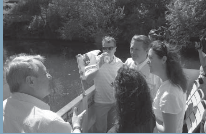
U.S. Senator Dick Durbin (on the far left) tours the Chicago River with Friends of the Chicago River.