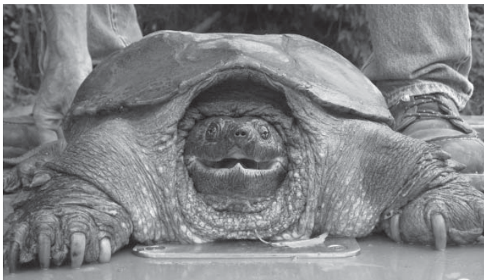
Large snapping turtle recently spotted in the Chicago River.