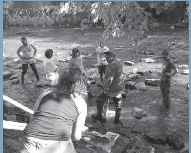
Exploration is the key to understanding a river. Participants get ready to sample macroinvertebrates during the Rivers Curriculum workshop.